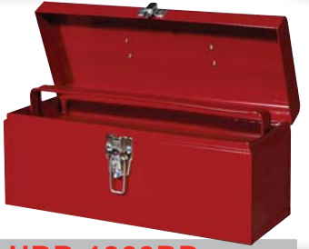
HBB-1900RD 19" HAND BOX

20"W x 7"D x 8"H 508mm x 178mm x 203mm (Old Part# B725)