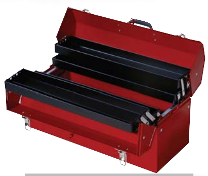
HBC-2100RD 21" CANTILEVER

21-1/4"W x 8-3/4"D x 12"H 539mm x 222mm x 305mm (Old Part# B529)