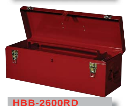
26" HAND BOX

21"W x 8-3/4"D x 9"H 533mm x 222mm x 229mm (Old Part# B520)