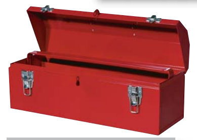
HBH-2000RD 20" HIP ROOF BOX

26"W x 8-3/4"D x 9"H 660mm x 222mm x 229mm (Old Part# B522)