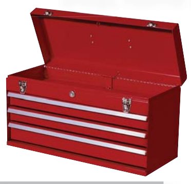
HBP-2103RD 3 DWR PORTABLE 21"W x 8-3/4"D x 12"H

A variety of portable handboxes to fit plant, shop, home and school applications