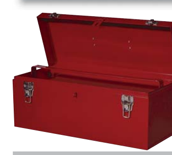
HBB-2100RD 21" HAND BOX

21-1/4"W x 8-3/4"D x 12"H 539mm x 222mm x 305mm (Old Part# B529)